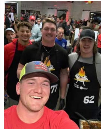
(FROM LEFT TO RIGHT) Patrick Mahomes, Andrew Wylie, and Austin Reiter. All Kansas City Chiefs players.